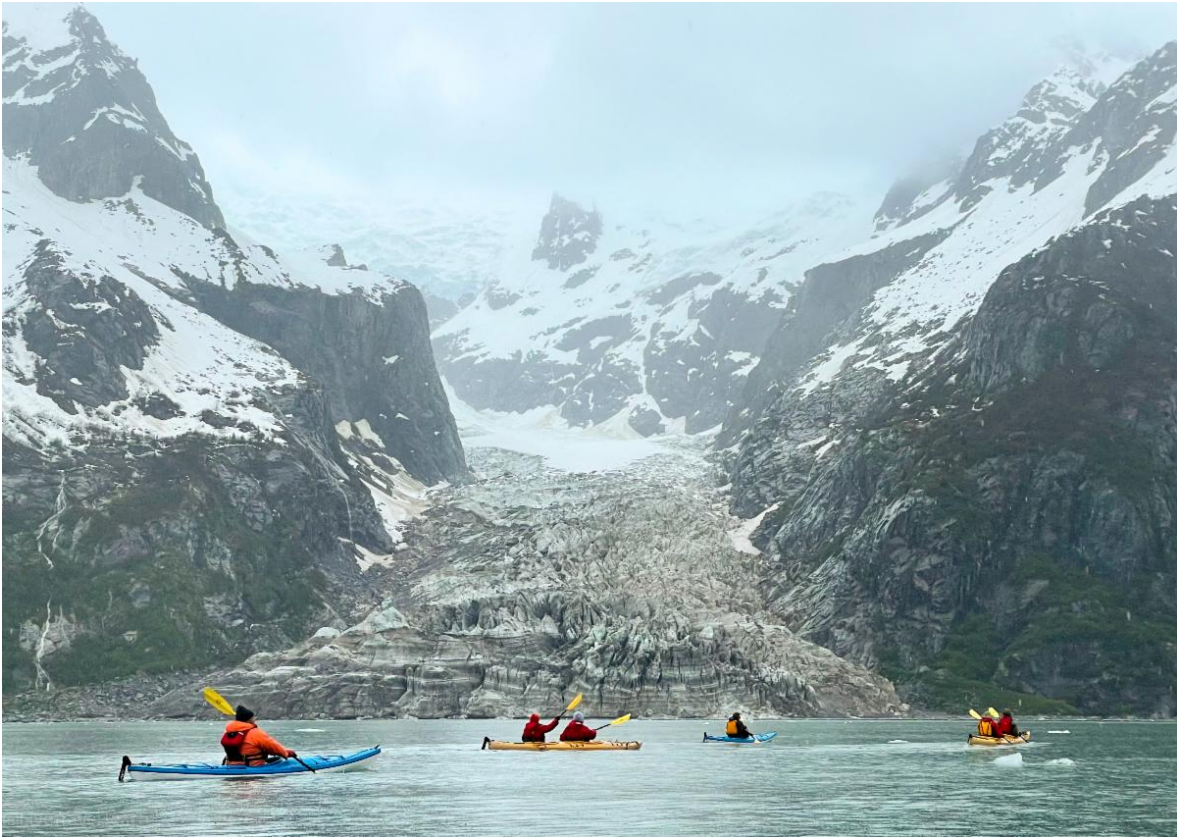
Photo from Kenai Fjords Floating Teacher Workshop, 2023