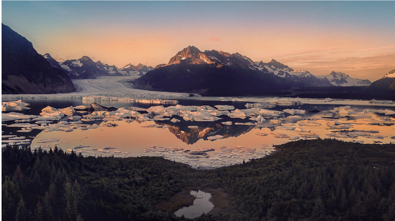
Sheridan Glacier, Chugach National Forest

News and stories from Alaska's public lands