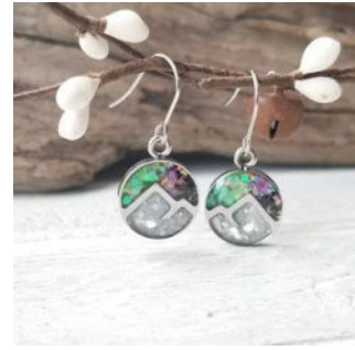
Northern Lights Mountain Small Dangles Earrings

Alaska Geographic works in support of our agency partners: