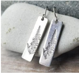
Steel Rectangular Fireweed Here & There Boutique Earrings

Check out these AK Public Lands themed items from Here & There and support AK Geo!