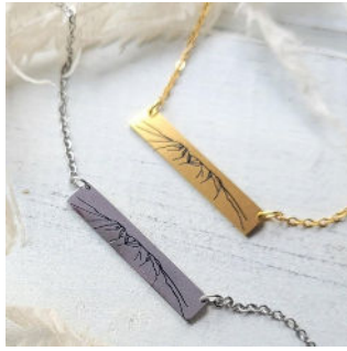
Alaskan Mountain Horizontal Bar Necklace