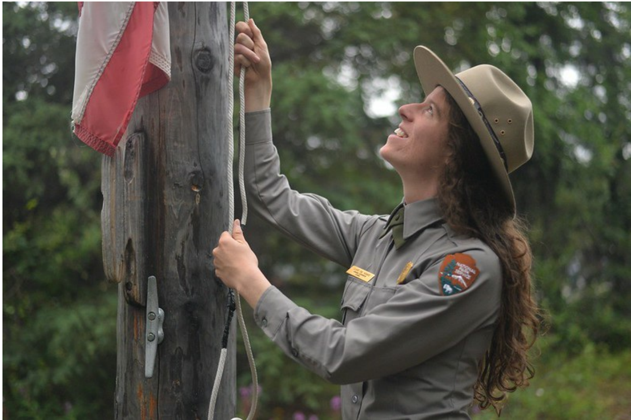
Seasonal 2017 Park Ranger in Denali National Park and Preserve .

News and stories from Alaska's public lands