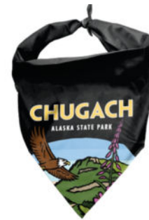
Bandana Dog Chugach State Park