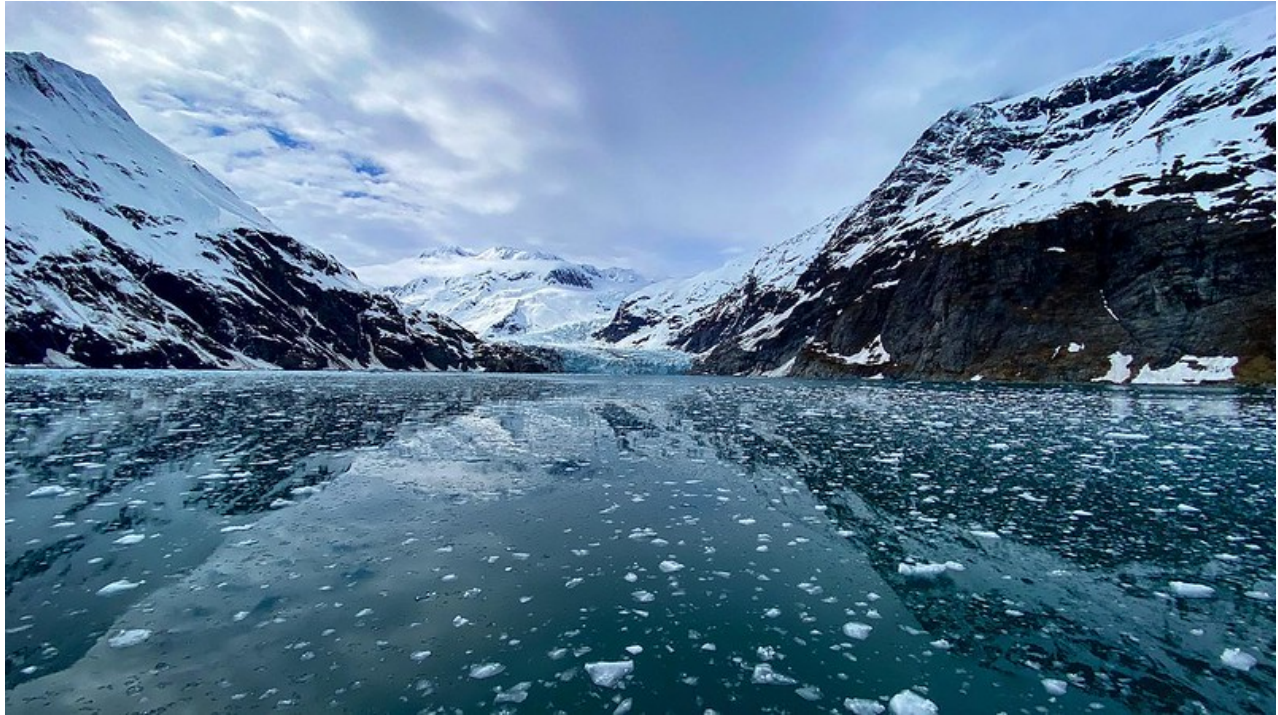
Surprise Glacier in Prince William Sound. Glacier Ranger District, Chugach National Forest.

News and stories from Alaska's public lands